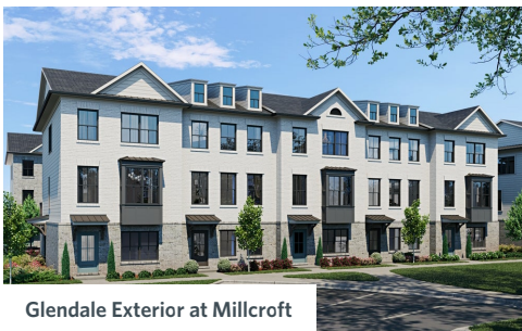
Glendale Exterior at Millcroft