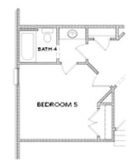
OPT Bedroom 5 with Full Bath 4 ilo Study and Powder Room