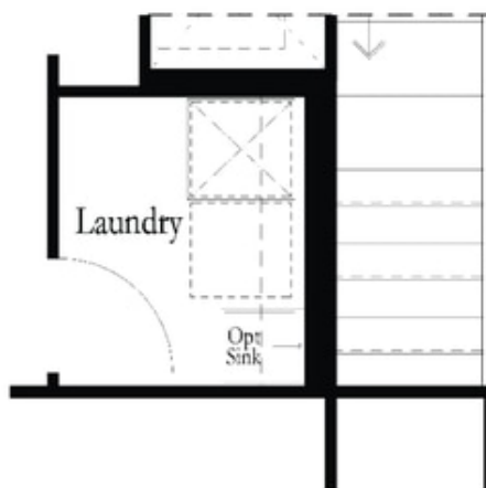
Opt. Laundry Room with Sink