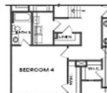
OPT Bedroom 4 with Bath 3 ilo Bonus Room & Powder 2