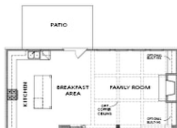
OPT Extended Kitchen