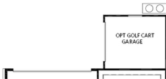
OPT Golf Cart Garage