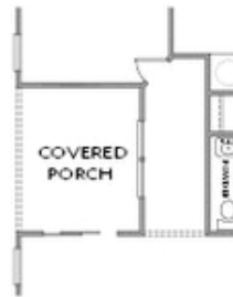
OPT Sliding Glass Door