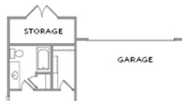
OPT Storage Unit